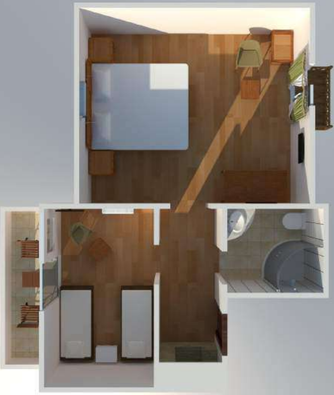
❖ Family Room Floor Plan