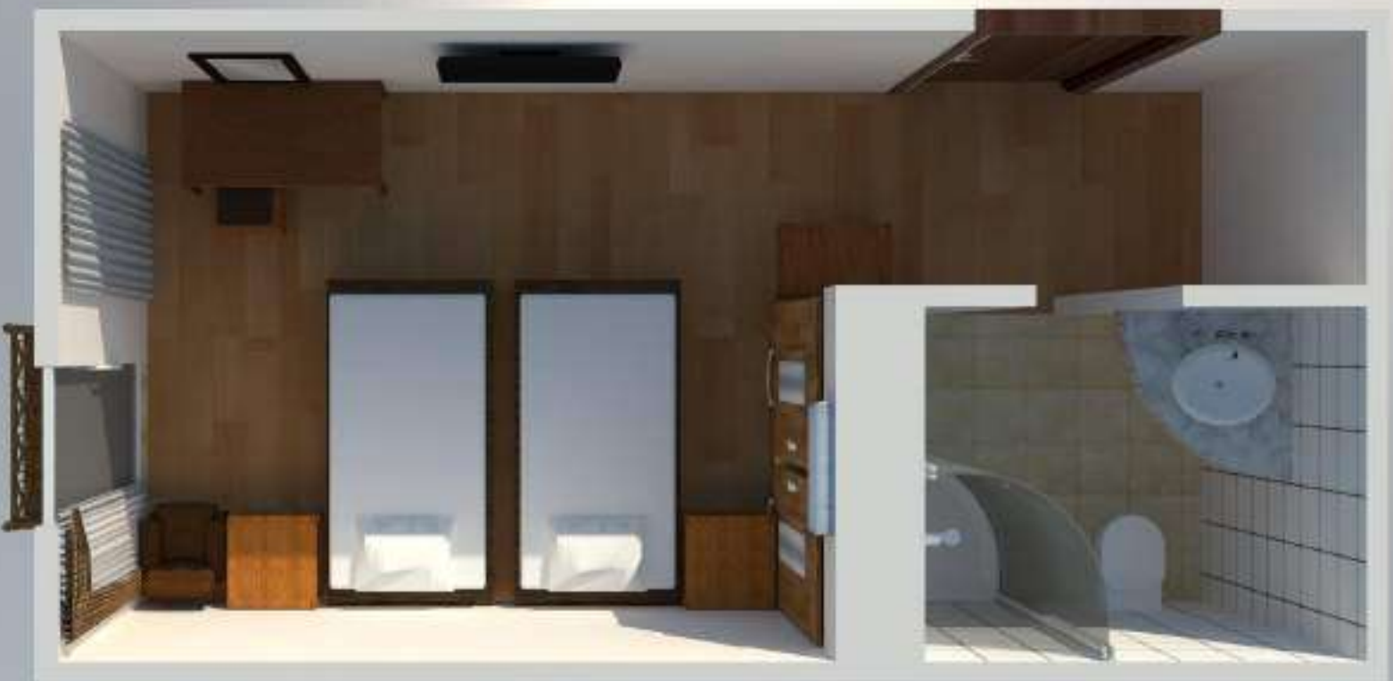
❖ Standard Room Floor Plan